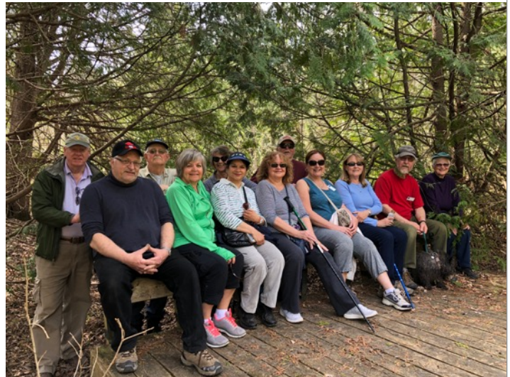
The Orono Crown Lands was the destination for our Hiking Group's May 9th walk. For more photos, check out the Photo Gallery on P7.

Lunch Meet: First Wednesday of the month after the Probus meeting.